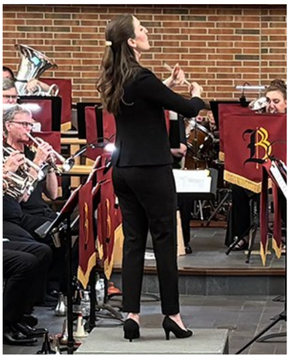
Lancaster British Brass Band in concert at The Lutheran Church of the Good Shepherd.

The 2024-25 Fine Arts season was nothing short of outstanding. What a year, and we have more excitement