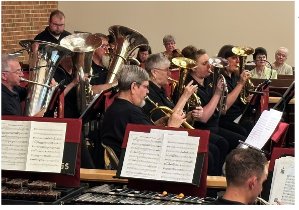
GOOD SHEPHERD FINE ARTS SERIES THE LANCASTER BRITISH BRASS BAND